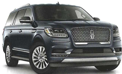
20" 14-Spoke Ultra Bright-Machined Aluminum with Painted Pockets NAVIGATOR