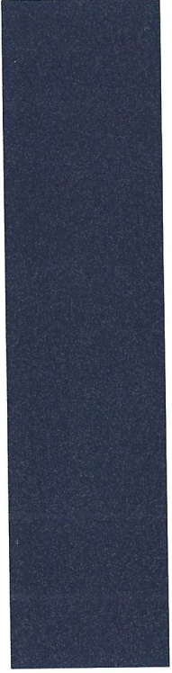
6 Blue Diamond Metallic