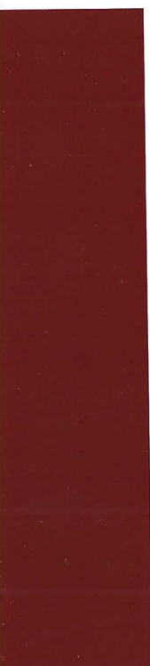
1 Ruby Red Metallic Tinted Clearcoat 1