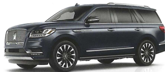
22" 12-Spoke Ultra Bright-Machined Aluminum with Dark Tarnish-Painted Pockets NAVIGATOR SELECT