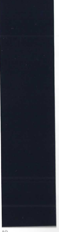
10 Rhapsody Blue 1