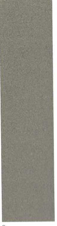
9 Iced Mocha Metallic 1