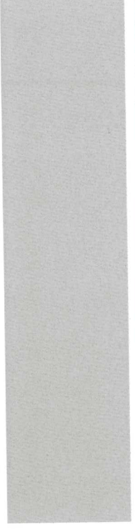
7 Ceramic Pearl Metallic Tri-coat 1