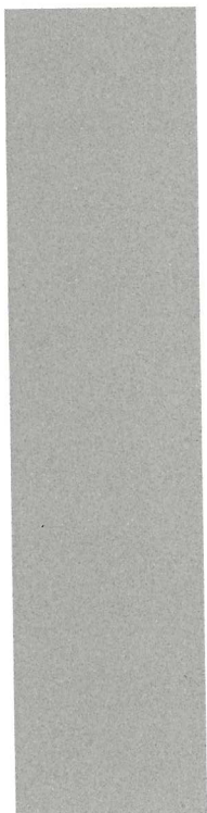
3 Ingot Silver Metallic