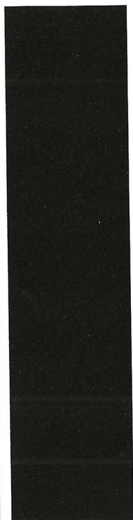
2 Infinite Black Metallic