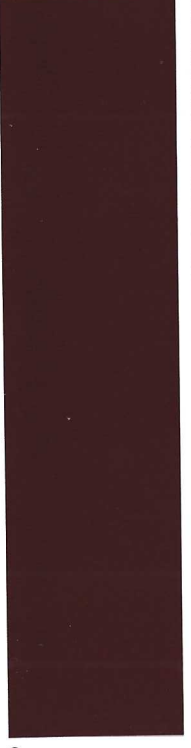
8 Burgundy Velvet Metallic Tinted Clearcoat 1